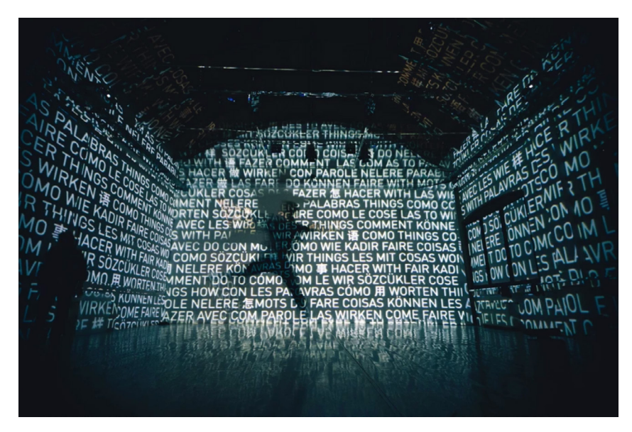
VOXsolo - Ariella Vidach-AiEP at Festival del Silenzio.

Visual vernacular is a form of visual poetry. It is not only linked to language, but it also extrapolates, borrows from the language and takes on a life of its own. It develops a scene, imagines moving pictures, captures the meaning without knowing specific signs.