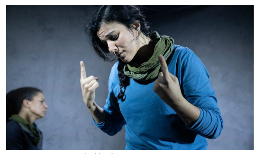
Hem - Tyst Teatre.

In Hem, various communication means were used: gestures, Swedish sign language and visual vernacular. Language deprivation is a significant issue that this play wanted to cover. It was important to leave the errors or the communication gestures in the play, as the characters, who didn't have full access to education as children in their real life, lacked some language skills, and this was visible in their use of Swedish sign