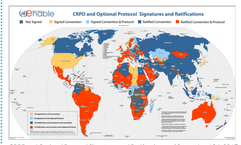
CRPD and Optional Protocol Signatures and Ratification as of September 19th 2017

The Convention for the Rights of Persons with Disabilities (CRPD) is a legally binding treaty that was adopted in 2006 and went into force in 2008. The Convention has been so far ratified by 177 countries and, according to the World Federation of the Deaf (WFD), "it is the first international treaty ever that recognises sign languages and the linguistic human rights of deaf people". According to CRPD, governments have to recognise sign language as an official language, guarantee interpreter services, and assure deaf people's education in their sign language.