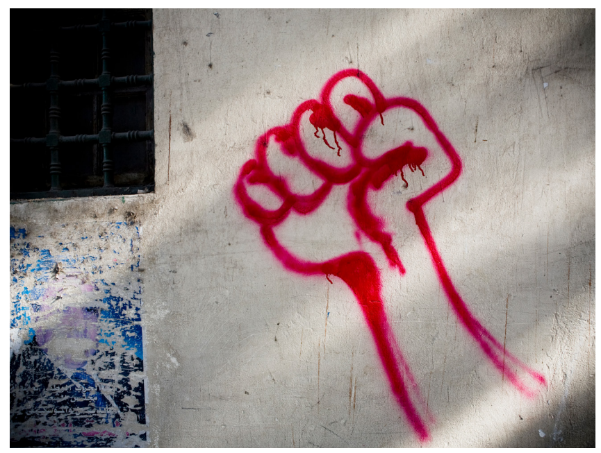
Graffiti painted on a wall in the area surrounding Mohamed Mahmoud street near Tahrir Square in Cairo, Egypt during the 2011 Egyptian revolution.

Nowadays, contemporary artists from the Arab region feel connected with Europe. When artists engage in what is often called