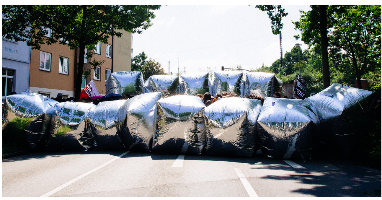
The Mirror Barricade (Die Spiegelbarrikade) by Theater Dortmund

In the years 2015-2018, a front line emerged in particular from the struggles for the Berlin Volksbühne: city theatre versus production house. The plan of Chris Dercon and the then Berlin Cultural Administration was to transform the Volksbühne, which had been set up as a city theatre with a repertoire system, into a production house with a seasonal system. Both Dercon and Berlin politicians, however, concealed from the public this structural change they were striving for. Instead, an attempt was made to push this change through the back door without public debate. The protest in the city was also aimed at this process, which was so fierce because these structural questions had and have an exemplary character. The question behind this is to what extent this country can and wants to continue to afford its unique but expensive theatre system.