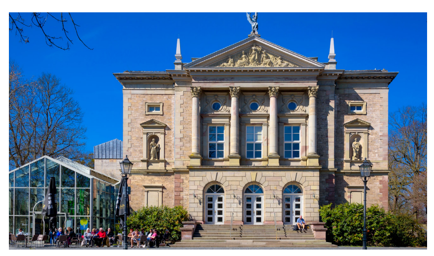
Göttingen - Deutsches Theater

According to the last published report, the KSB distributed a total of around \in 18 million in project funds in 2015, with projects in the performing arts accounting for almost 24 percent. (Source: KSB Annual <u>Report 2015</u>)