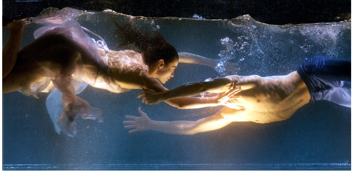
Dido & Aeneas by Sasha Waltz