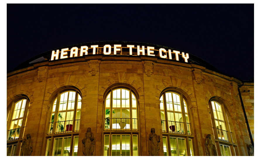
Theater Freiburg

The Federal Republic of Germany has the largest and densest network of institutional and independent theatres in the world. This range includes city, state and national theatres run by states and municipalities and commercially-run musical and entertainment stages, as well as a high density of independent theatres, dance companies and performance groups, which generally finance their work with funds from various state funding programs. The city and state theatres are the ideational and structural backbone of the German theatrical landscape, and their budgets are fixed items in the budgets of their respective cities or municipalities. These theatres are characterized by standing buildings, permanent ensembles, and the permanent presentation of artistic works, as well as by their employees who produce stage sets and costumes for the productions. The repertoire of the respective theatre exclusively contains these in house produced works. A special role is played by the state theatres, whose cultural-political mission also includes to perform in the surrounding regions that do not have their own public theatre. As a rule, therefore, fewer than half of the performances take place at the actual location of the respective state stage. The operation of theatres in the ensemble and repertoire system within the dense network in this country is an internationally unique selling point for the German-speaking theatre landscape.