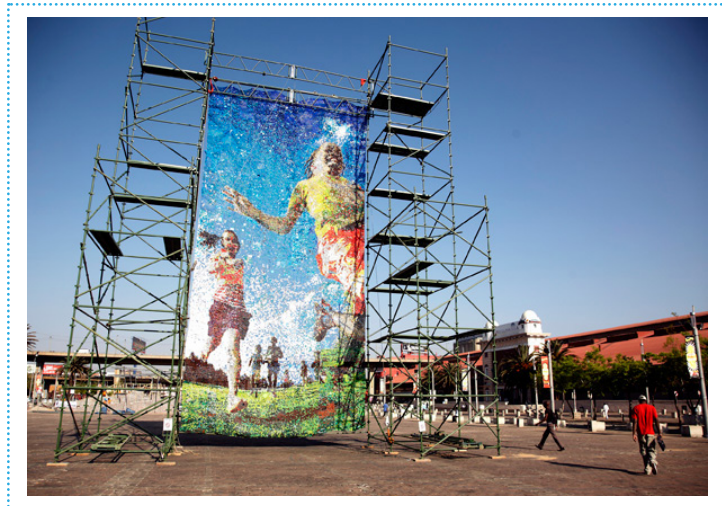
Art from plastic bottles

'On the eve of independence for most African countries in the 1950s, development economists and international development agencies were beginning to seriously contemplate the necessary strategies for facilitating development in the emerging nations....As the 60s drew to a close, some dissenting voices could be heard in the development economic community. These voices...began to question