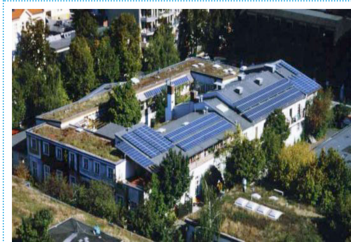
ufaFabrik in Berlin, Germany

It is important to recognise the best practice examples where the arts community extends beyond conceptualisation to enshrine environmental practice in their approach. With support from funding bodies, and frequently with partnership from environmental organisations, the arts community is exemplary in championing social change in a way that incorporates environmental goals, be that through managing emissions, using recycled materials or using digital technology to avoid travelling where possible.