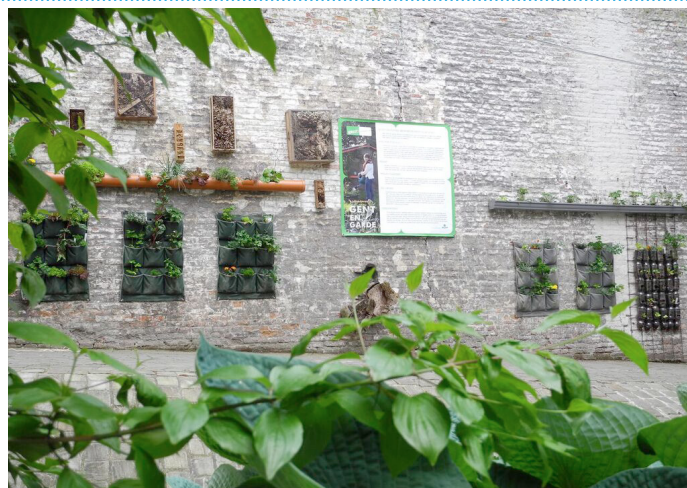
'Troeptuintjes', an Edible Garden Ghent - public are encouraged to pick and try

instead of an exhibition, Skype and social media to gather audience feedback instead of an after-show Q&A. Not that this should exist in isolation, it presents an opportunity to fundamentally change how art is made, and in relation to environment, significantly reduce overheads and impacts that are borne in the traditional arts workplace. What we wait in anticipation of is a change in approach by funding bodies to support digital creation. The Space , a high-profile agency, commissioning body and recipient of vast public funds in the UK, aims to pioneer art making in the digital sphere. It supports artists and organisations to use technology to extend the reach of existing activities, embrace innovation, connect with new audiences, and play. 'Karen is My Life Coach' , an app project created by Blast Theory and co-commissioned by The Space among other partners, uses digital technology to offer a new gaming and storytelling experience involving life coaching and personality profiling. NT Live digitally streams National Theatre productions to cinemas across the world, has displayed phenomenal success in pioneering digital enhancements to their service as a venue to bridge the gap to new audiences who may