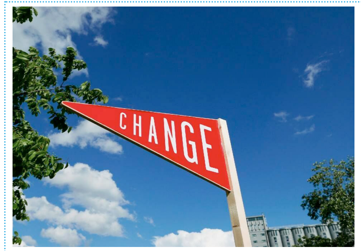
Olivier Darné et le Parti Poétique, 'La République forestière', 2015