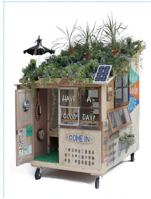
MOBILE HOUSE ( Practice for a Revolution ), Kyohei Sakaguchi 2012

culture and heritage, and about sustainability. We see more people actively and passionately speaking up about say, conservation issues rather than just leaving it to the government as in the past. There is also growing interest in the preservation of the traditional arts because of how they speak to who we are as a people and a nation.' 3 This more holistic approach to sustainability was central, not just in Singapore but in most other countries such as Indonesia, for instance. This approach relates not strictly to the natural environment but to tradition, each other, to the community and quality of life (and food), without S-branding it. What the West has called Urban Farming, is what practically everyone in Korea has been doing forever with pots of chillies growing on every rooftop. No one would call that urban farming in Seoul. To start to understand each other we need to understand the different rhetoric, interpretations,