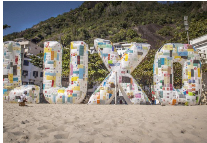
'Luxo è lixo' (Luxury is Trash), project by Basurama in Brasil.

How can we understand the sheer volume of man-made waste, floating plastic islands and the wreckage of a tsunami?