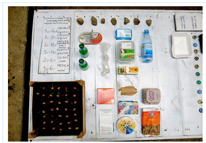
Picture from The Museum of Garbage