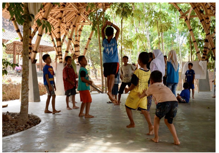
Neighbour children making theatre with a resident artist, November 2015.

A city is more connected to its people as a local-community than on the level of a nation state, where the majority of intrusion, encroachment and transfer of the commons into public or private properties take place. This in turn weakens urban communities like cities. In post-colonial states 'nationisation' (the process of becoming a nation) and modernisation brought together rapid urbanisation. Conflicts between different approaches to housing and urban developments are witnessed across the world because of that process. Privatisation has significant effects on communities experiencing poverty. Diversity and creativity in local communities are often homogenised by governments towards one single facet or approach. These tensions reflect the distance between communities in practice and nation states championing the common interest. The successful environmental conservation programmes