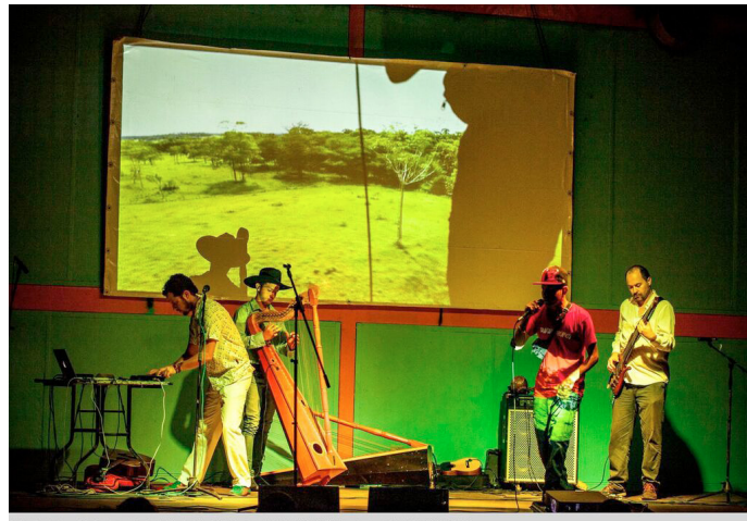
Sinfonia Trópico

such as the loss of important ecosystems. Environmental activists and experts discuss the socio-economic and political contexts of diversity. In addition, the artists and experts seek to engage the public in the different areas to generate debate. SINFONÍA TRÓPICO was launched in 2014 and will extend over a period of 2 years.