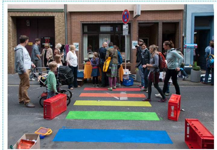
The 'Tag des guten Lebens' in Cologne, is not only a yearly car-free-Sunday festival with 100 000 visitors, but a space of possibility where thousands of residents in many streets develop own creative re-appropriations of urban space.

To be able to unfold these potentials for change, artists need open frames that allow for unplanned experiments and stimulate critical learning. The art manager's role is thus to open up these frames, allowing and fostering these artistic reflexivities and letting them flow through the arts organisation. The arts professionals can also