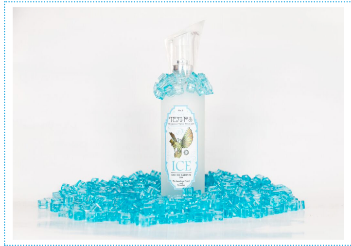
'Ice' by Catherine Young, The Apocalypse Project - the Ephemeral Marvels Perfume Shop