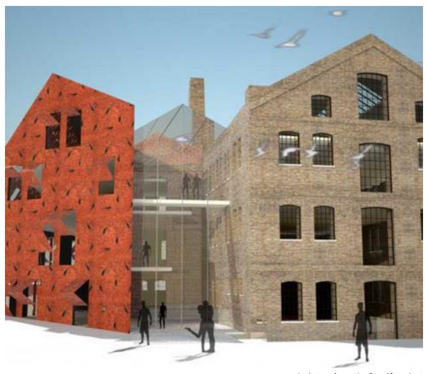
A picture from the Specifi project

Interreg Va provide 60-70% contribution to the total (eligible) project budget (i.e. 30-40% matching funding is required).