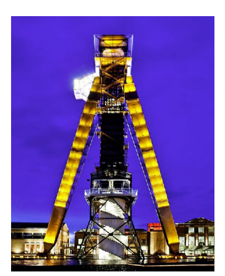
An image of the former coal-mining site in Genk, Belgium, transformed by the project <u>C-mine</u>)