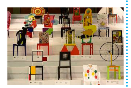
A picture from the project Art on chairs

chambers of commerce to businesses, municipal authorities, universities and schools, allowing the transfer of knowledge and expertise from local universities to the furniture industry. Total investment: € 1,095,535 (of which EU contribution through the ERDF: € 931 205).