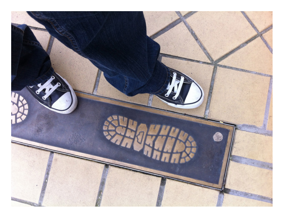
Walking in Hamish's footsteps - picture from the project <u>Time and Place</u>

Specific lists of potential beneficiaries of the projects are available for each investment priority in each programme but generally include SMEs, social enterprises and not-for-profit organisations, universities, intermediary agencies and local or regional authorities, and the general public including excluded populations or those at risk of exclusion.