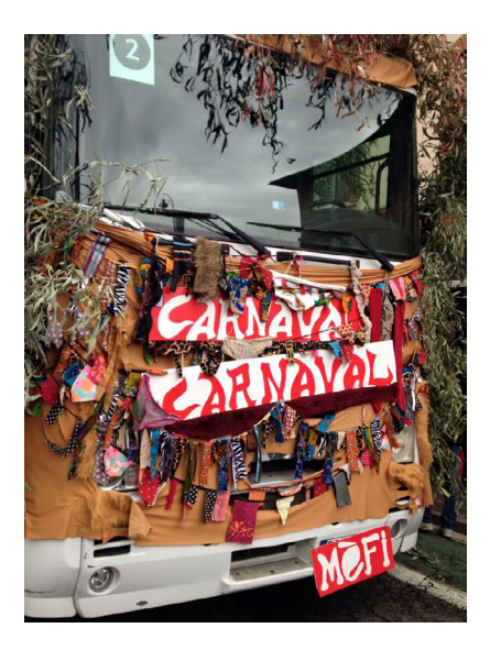
picture from <u>The management of the festive rituals</u> <u>in the public areas</u> project

The programme reaches individuals through organisations, institutions, bodies or groups that organise such activities. The specific conditions for the