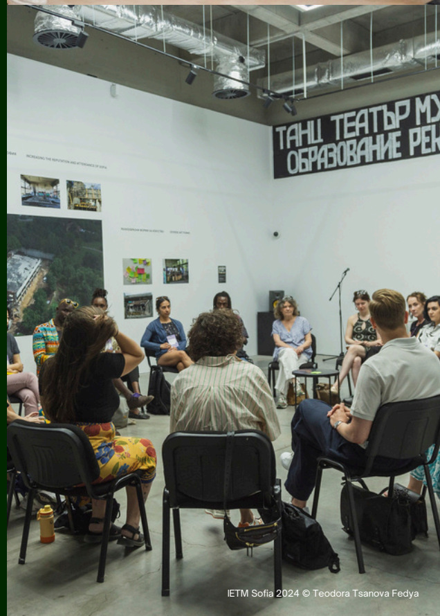
IETM Sofia 2024