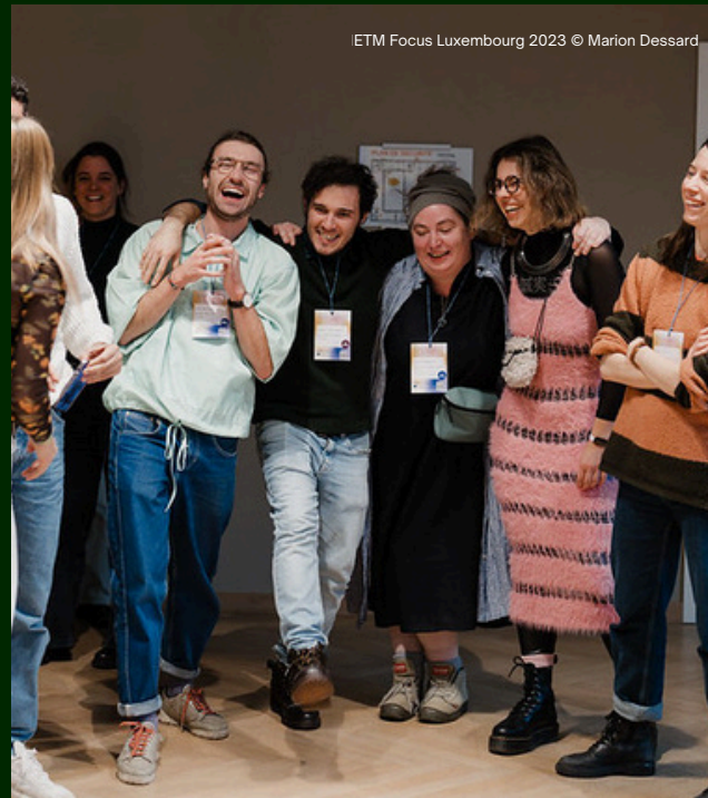
IETM Focus Luxembourg 2023