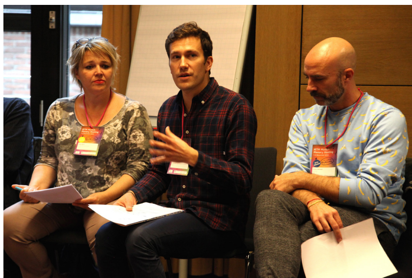
© Silke Schmidt / Regine Heiland

It was interesting to note that the majority of the participants were women. A representative of the producer workforce? Or perhaps simply the artistic community in general.