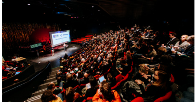
Opening Keynote of the Hull Plenary Meeting