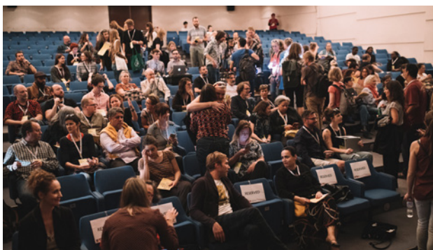
Rijeka Plenary Meeting

Annually, we hold two plenary meetings in different European cities, as well as smaller meetings all over the world. In addition, we also commission many publications and research projects, and facilitate communication and distribution of information whilst advocating for the value of culture and the arts in a changing world.