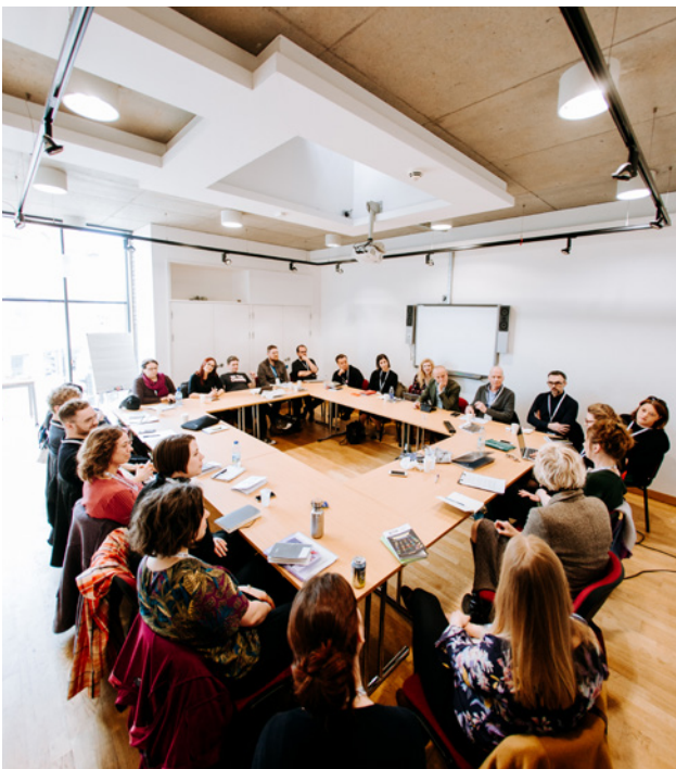
Associate Members meeting at the Hull Plenary Meeting