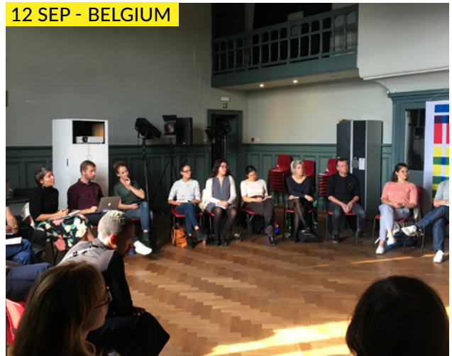
On the Road Ghent