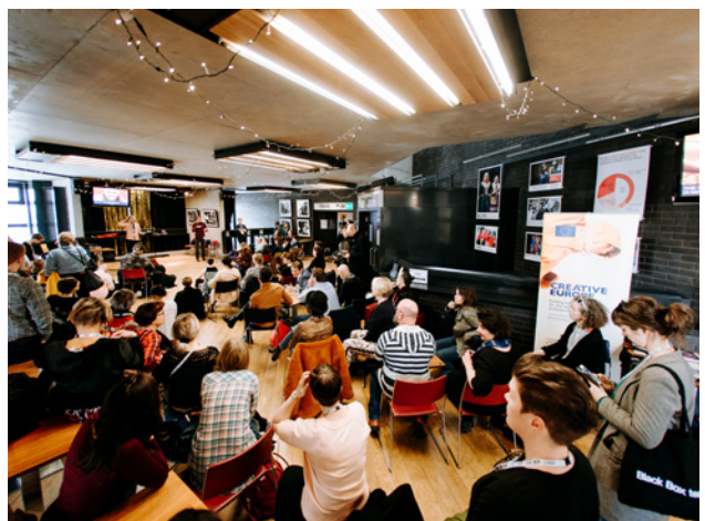
Hull Plenary Meeting