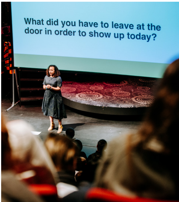
Hull Plenary Meeting

IETM Hull 2019 explored the reality of inclusion in today's societies, in their artistic representations and in the process of creation. We examined issues around race, ethnicity, faith, disability, age, gender, sexuality, class and economic disadvantage and any social and institutional barriers that prevent people from participating in and enjoying the arts as an integral part of the societies they live in.