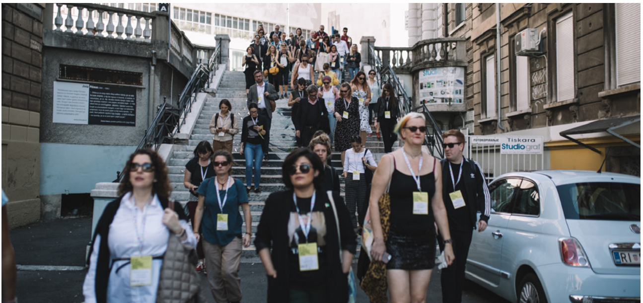
Participants at the Rijeka Plenary Meeting going on one of the available artistic walks around the city