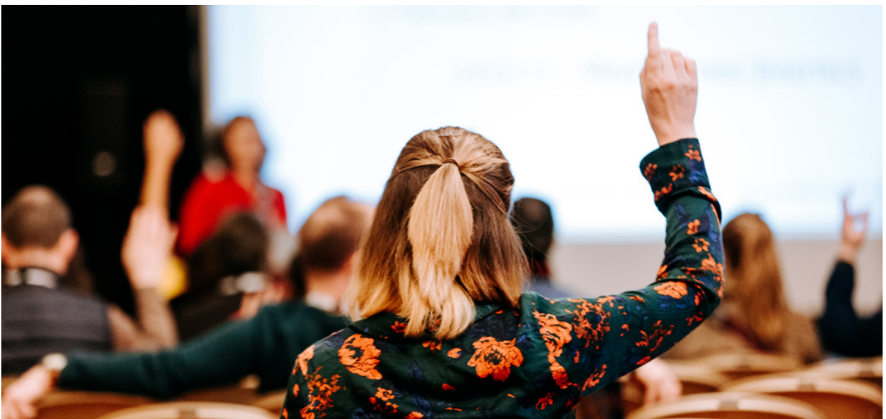
Hull Plenary Meeting