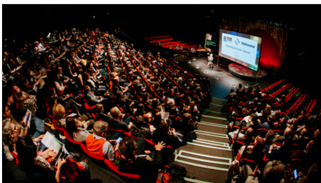
Opening Keynote of the Hull Plenary Meeting