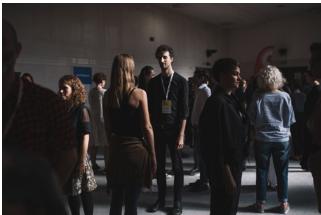
Introductory "Who's there?" networking session at the Rijeka Plenary Meeting, photo: © Tanja Kanazir