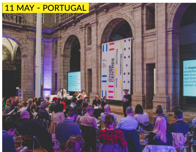
IETM Porto Plenary Meeting 2018, photo: © Cesar Coriolano

In spring 2018, IETM Porto brought together nearly 700 performing arts professionals from all over the world for discussions on how art relates to the processes of transforming centres of creation, dissemination and decision-making. One year later, in partnership with Teatro Municipal do Porto and Bússola , we headed back to Portugal to assess the impacts of the meeting, exchange best practices, and discuss the challenges the Portuguese arts community is facing today.