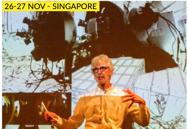
Symposium Singapore