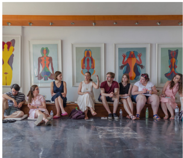
Campus Eleusis, photo: © Pantelis Ladas LDSPRO. NET // Courtesy of Eleusis 2021