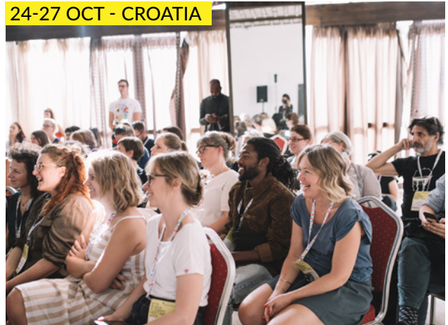
Rijeka Plenary Meeting