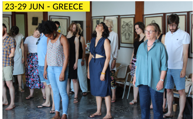
Participants in the Campus Eleusis, photo: © Ása Richardsdóttir