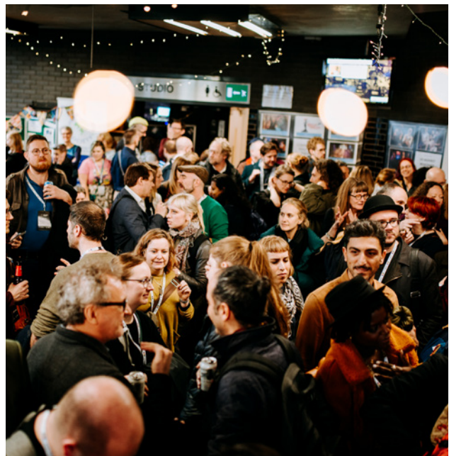
Hull Plenary Meeting