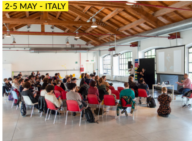
Satellite Milan